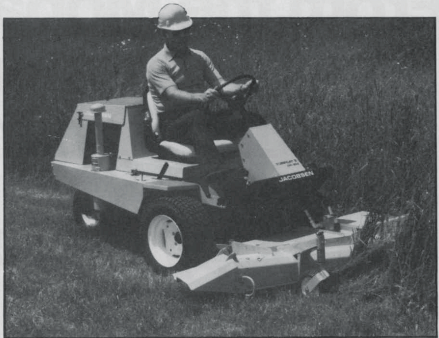
This riding mower's hydraulically driven cutter blades make short work of field grass. A snowthrower, dozer blade or rotary broom can be attached in place of the cutter deck to handle other chores throughout the year.

Preventing a leak is a matter of preventative maintenance, that is establishing a procedure of routinely checking tubes, hoses and fittings, and other components for evidence of leakage, wear or looseness. This could be a part of an overall check before the machine moves out onto the turf and when it returns.