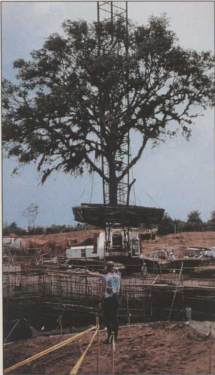
This huge oak was saved from a cattle pasture and replanted in Disney's Animal Kingdom. It's now one of the favorite locations for a family of gorillas.

spring 1999. It will feature a rain forest populated with Asian animals.